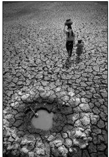
Fetching water in Pakokku