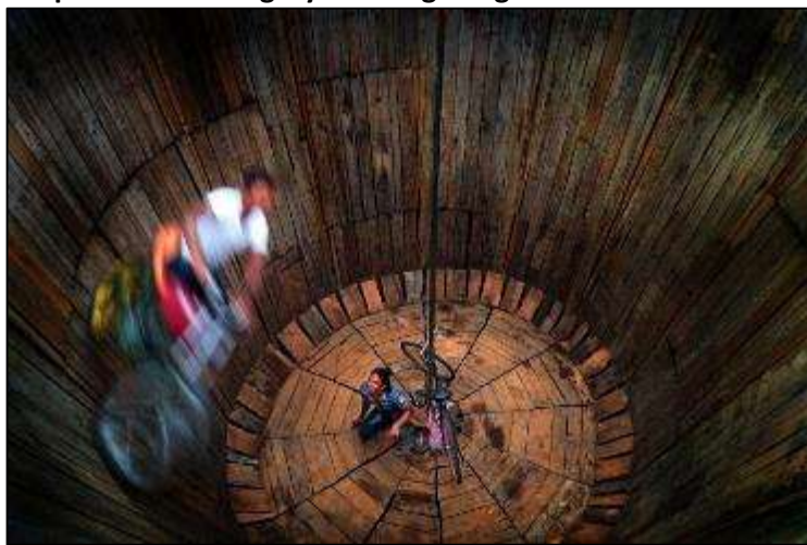
Colourful Light, Sri Lanka