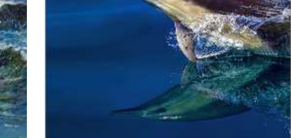
Winner: Leaping Joy