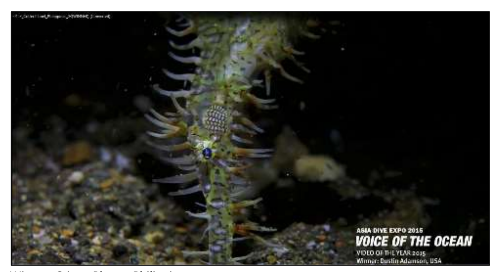
Winner: Critter Planet, Philippines