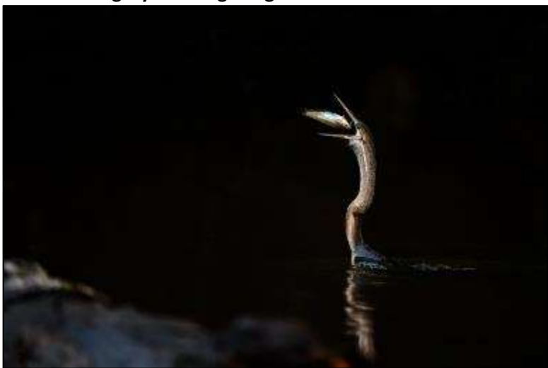
Got it, Malaysia