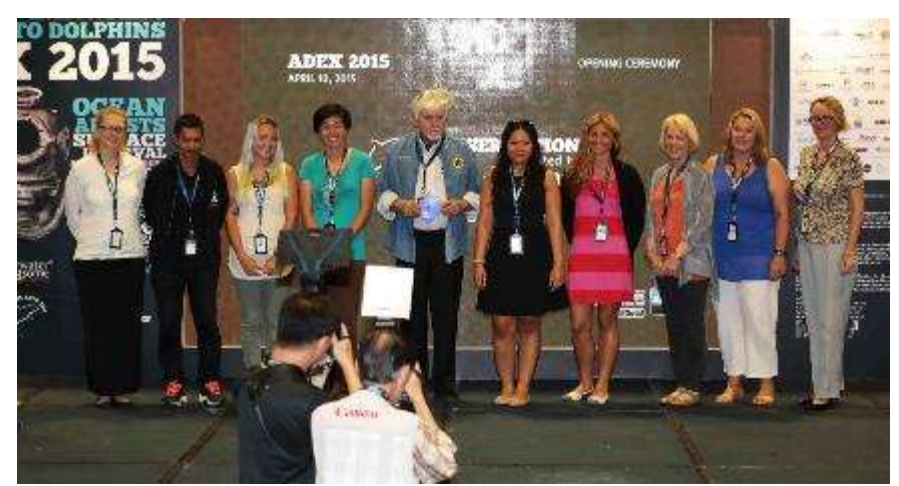
ADEX 2015 conservation speakers at the Opening Ceremony on Fri 10 Apr.

From a 20-year story of a once obscure population of dolphins that is now one of the most studied on the planet, to the convergence of Malaysia's waterways, river and sea, providing an amazingly rich habitat in which people, dolphins and fisheries strive to maintain Nature's delicate balance, to the sustainability of the oldest dolphin-watching site in Bali and more, the ADEX 2015 conservation segment was overflowing with not only dolphin-centric topics, but also covered a range of ocean conservation concerns across the board. The emphasis on conservation at ADEX makes it one of the most significant dive shows in the world. This is reflected in its official publication, Asian Diver magazine.