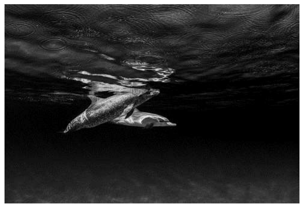
Winner: Mother Calf Bimini