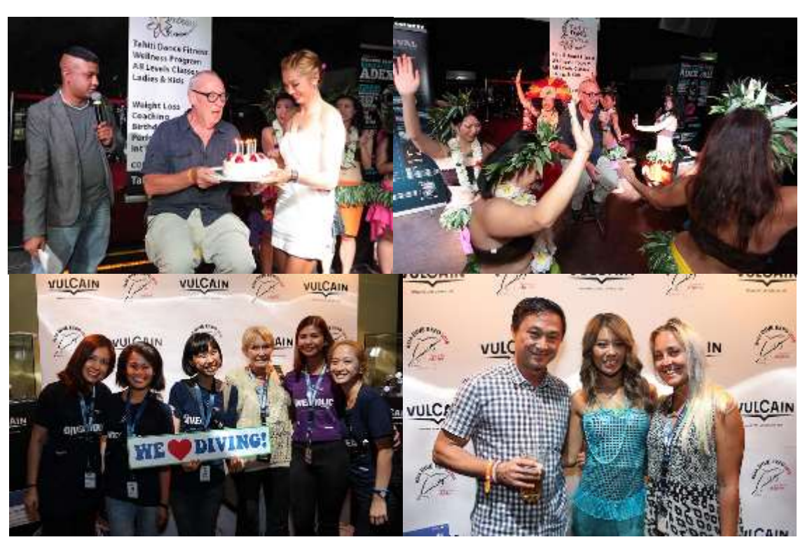
Sponsored by: Pump Room