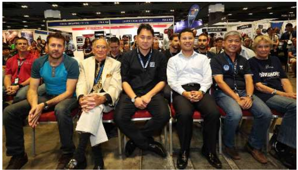
Opening Ceremony Guest of Honour, Desmond Lee, Minister of State (4th from left)