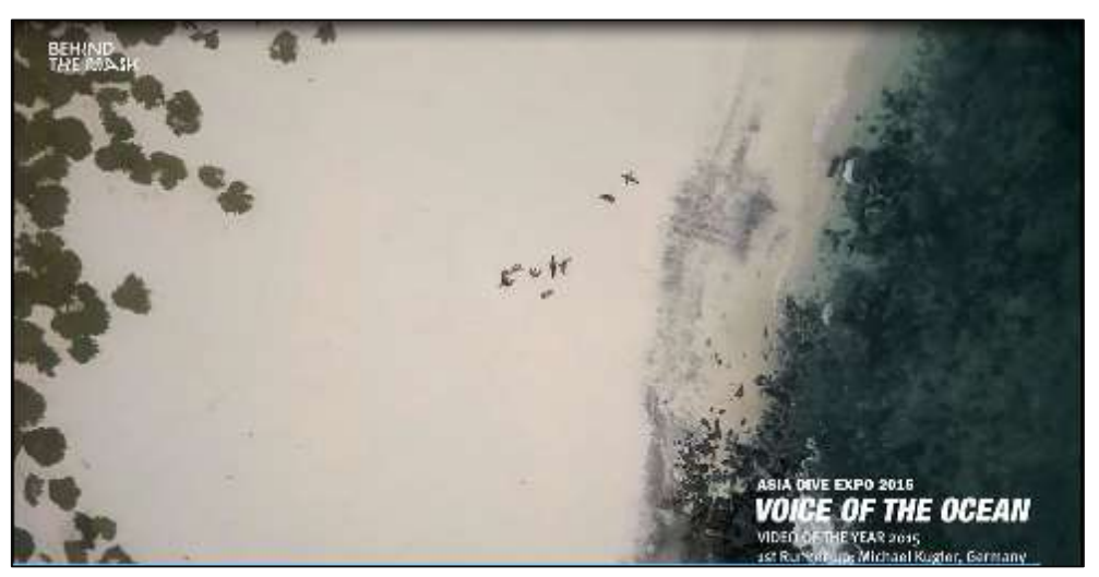
Runner-Up: Plaza Islands_Galapagos