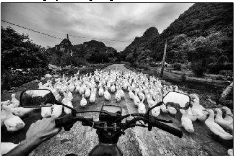
On the road, Vietnam

Day 2 at the Suntec City Hall 401 to 403 ended on a high with the everdelightful lucky draw prizes which included: