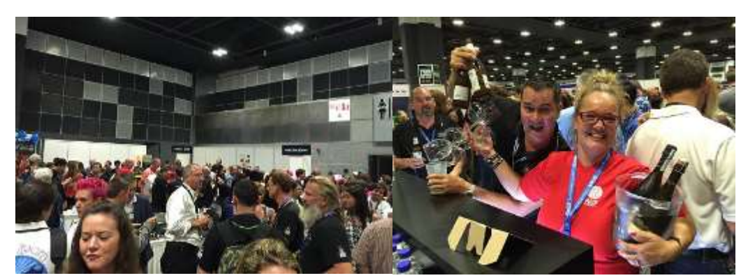
Partners: Wine Mansion, CuttySark, Singha Beer, Pioneer & Outback Steakhouse

The winner of Best Booth Design was announced during the party with the prize going to Seacam, who won a free (3x3) booth in ADEX SG 2016.