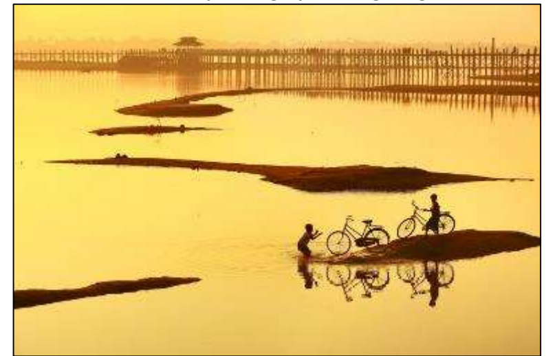
U Pain bridge