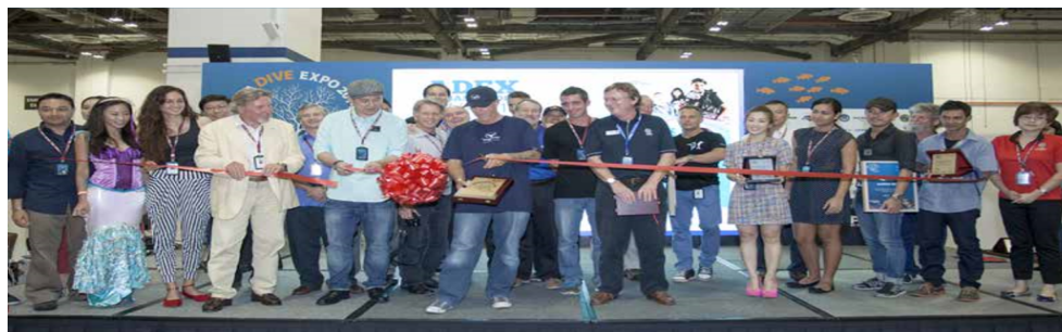
Guest of Honour – Wyland (holding plaque), Marine Life Artist