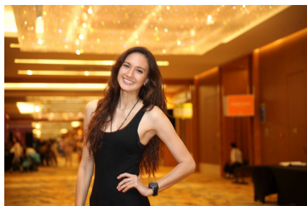
ADEX Ocean Ambassador 2014-2015: Nadine Chandrawinata