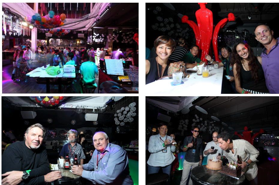
Sponsored by: IndoChine, Taiwan Beer and PH Balancer