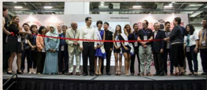
The Opening Ceremony with some of ADEX's distinguished guests