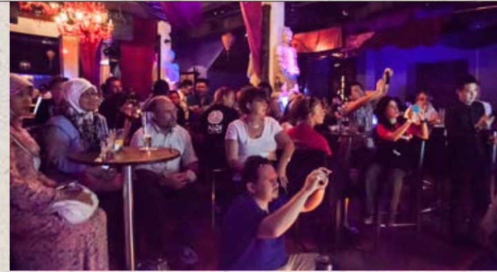
It's party time for exhibitors and speakers