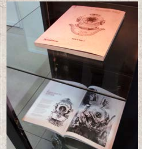
The much awaited book, Dive the Big Blue: A Historical Affair