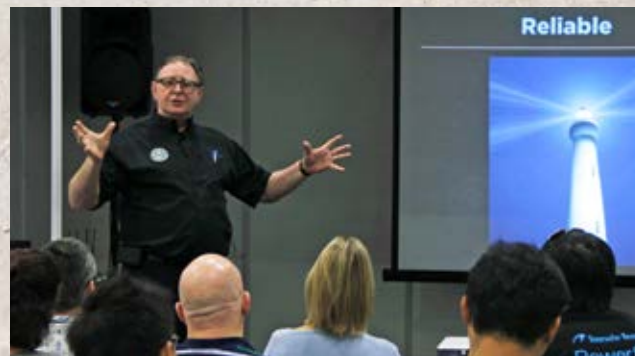
Intriguing details by Bruce Patridge