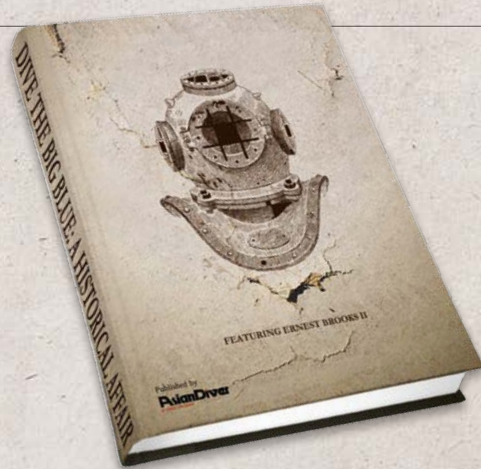
Launched: Dive The Big Blue: A Historical Affair , showcasing an extensive look at the evolution of the diving world, exhibiting the stunning black and white works of underwater photographer extraordinaire Ernest Brooks II and chronicling the world of underwater photography

THE OFFICIAL PARTY of ADEX 2013 returned to a favourite old haunt. With some early arrivals, IndoChine's Forbidden City at Clarke Quay became the place to be as almost everyone who is anyone in the dive industry came out to play. The party's Guest of Honour, Ernest H Brooks II himself, made a touching presentation of his work, which captured a very strong message of conservation. The combination of its moving audio and visuals brought tears to many a diver's eye. It was a much-awaited moment to witness rare greatness. With drinks flowing and finger food floating around, attendees had the time of their lives. Setting the premise alongside IndoChine's towering terracotta warriors and elegant blend of old-world oriental charm and modern sophistication within, raggaeton and R&B tunes impressed the night effortlessly.