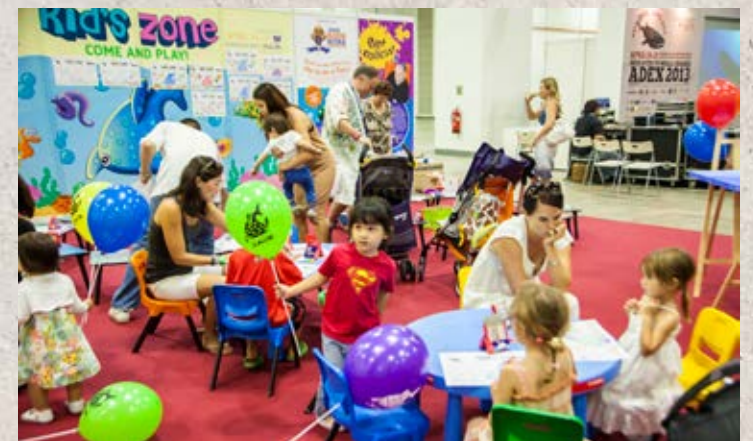
So many young 'uns: Future divers?

In a show of support for the global dive community and endangered marine creatures, the contestants of Miss Scuba International 2012 graced ADEX with their respectable presence. Besides representing universal beauty and elegance, these individuals more importantly play the role of underwater activists, promoting healthy, sustainable dive practices as well as conservation ideologies.