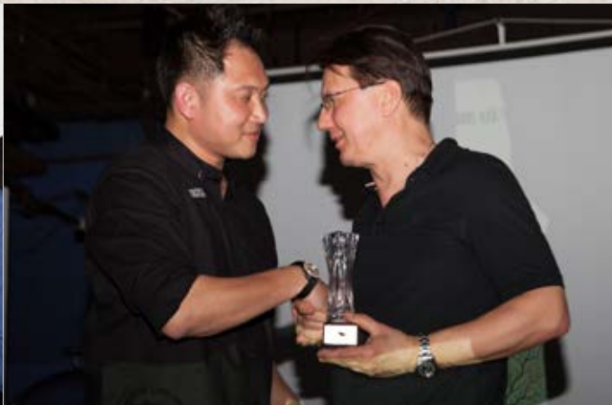
Best Booth ADEX 2013 goes to Seacam, who wins a free booth worth S$4,200 at ADEX 2014