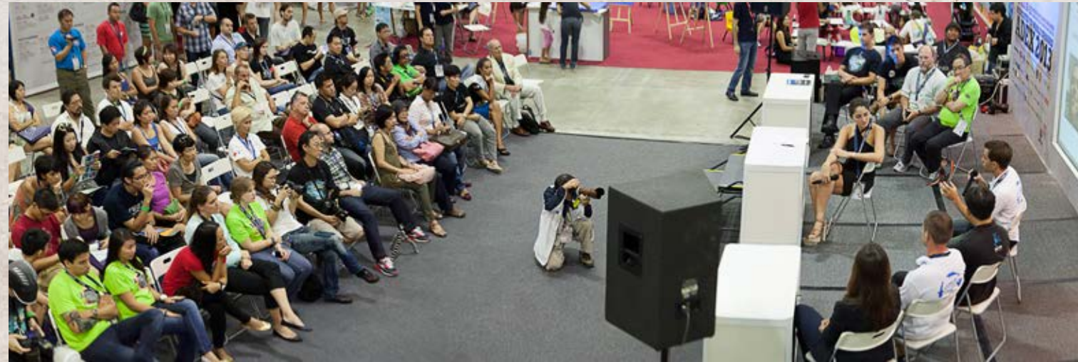
The Big Blue Buzz: The ADEX forum between angels of our ocean