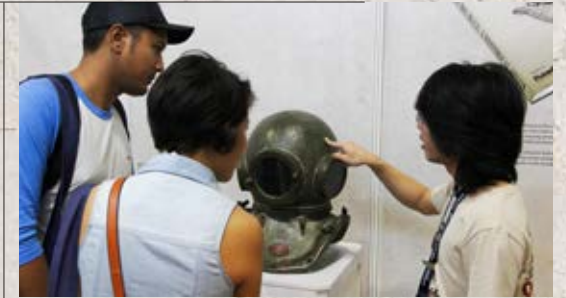
Keen listeners as history is revealed