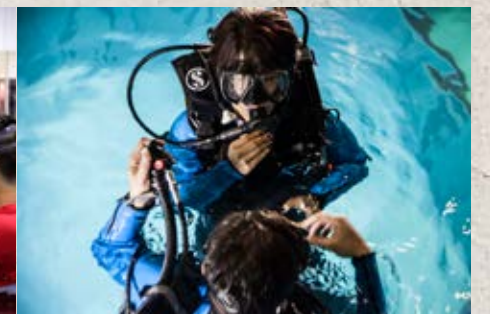
Try dives for adults at the famous ADEX tank