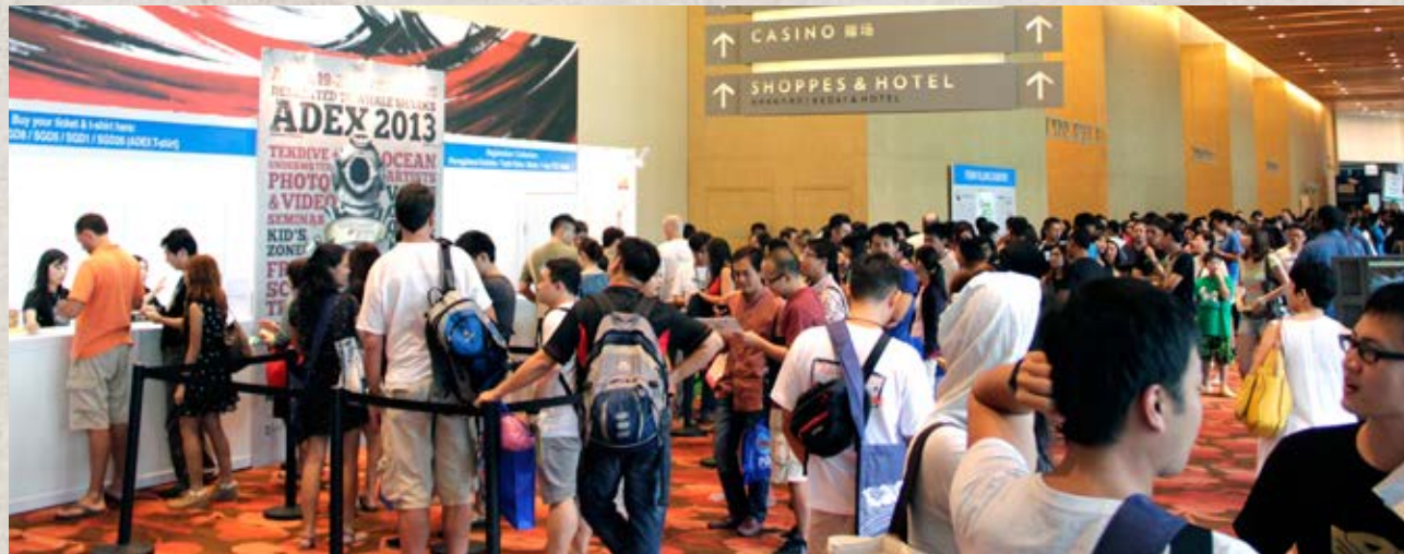
The onslaught begins